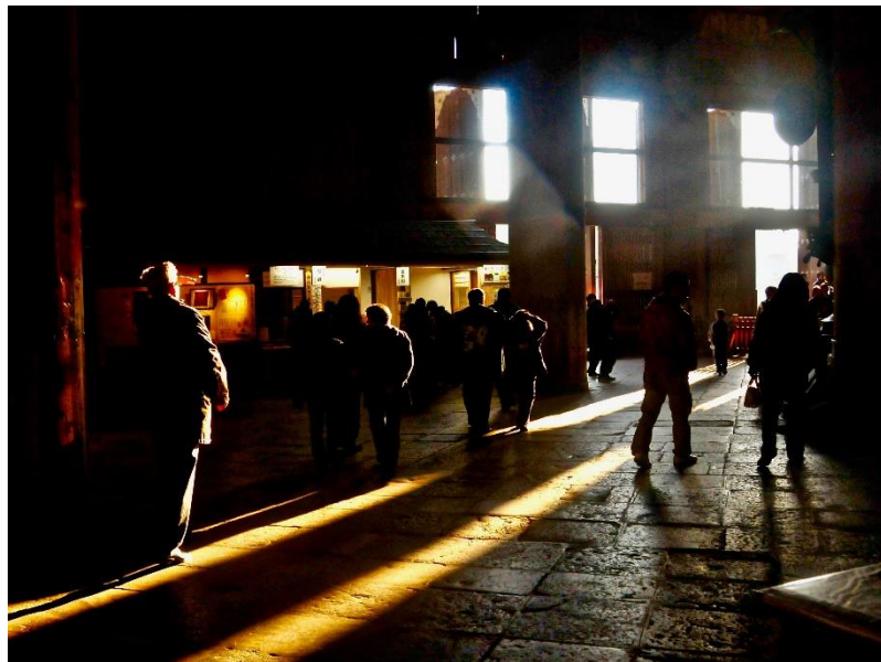
Photo of the Month—Large In the depths of the temple – John Pickup